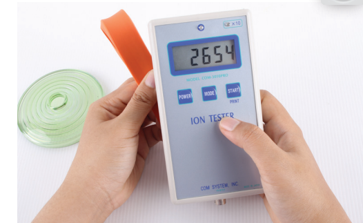
Negative Ion level testing for the Rejuvé Crystal protective rubber band