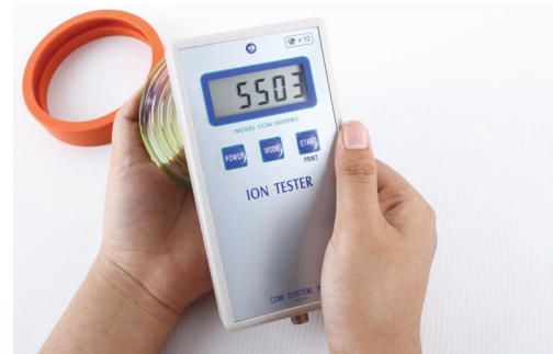
Negative Ion level testing for funnel-shaped glass of Rejuvé Crystal